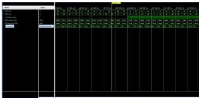
Fig1: Behavioral Simulation

consumption of the circuit, 50% of the generated partial products are replaced by an 8-bit constant value, "00000110." The truncation of the partial products is an effective way to minimize the number of logic operations in the proposed multiplier. The rest of the partial products are then processed using compressors and adders. The 4-2 compressors are employed in the initial stage of the multiplication operation to achieve some level of accuracy, followed by the use of approximate compressors in later stages to minimize power consumption and maximize speed. The compressors are effective in reducing the number of input bits to be combined and thus accelerate the multiplication operation.