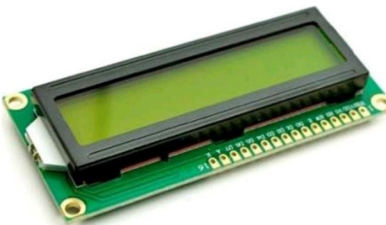
Fig 6: LCD Display

Technology known as LCD (Liquid Crystal Display) has completely changed how information is shown and used in a variety of electronic gadgets. An LCD display is composed of a panel of many small liquid crystal cells positioned between two glass substrates and two polarising filters. Depending on the electric charge given to them, these cells have the ability to either block or permit light to pass through. This characteristic allows the display to selectively alter the flow of light to form text and images. Compared to conventional CRT displays, LCD displays provide a number of benefits, such as sharp image clarity, high resolution, and low power usage. They are extensively utilised in many gadgets, including digital cameras, cell phones, computer monitors, and televisions.