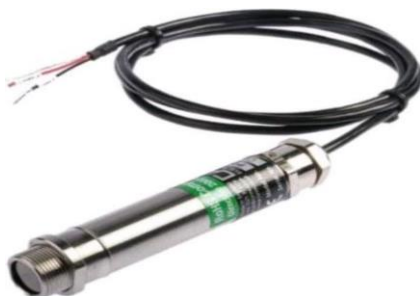
Fig 2: IR Sensor

A device that picks up infrared radiation generated by objects is called an infrared (IR) sensor. It functions on the premise that heat energy is emitted by all objects above absolute zero in the form of infrared radiation. Usually, these sensors are made up of an IR emitter and a receiver. Infrared radiation is emitted by the emitter, reflects off of things, and is subsequently detected by the receiver. The radiation is collected and transformed by the receiver into an electrical signal that can be used for analysis to detect changes in temperature or the presence or absence of things.