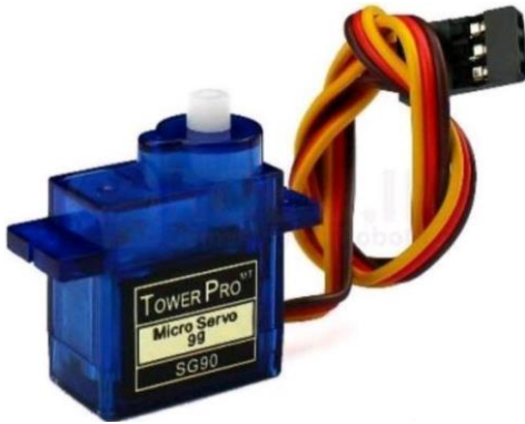
Fig 7: Servo Motor