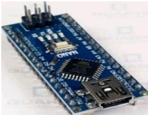
Fig 1: Arduino Nano

The Arduino then activates the appropriate actuators to separate the waste.