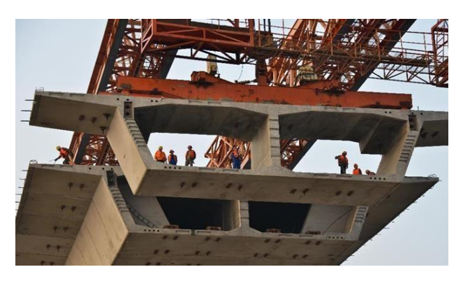
Fig 2. Box girder