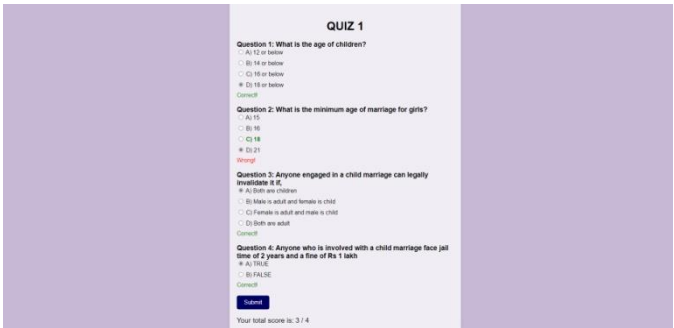
Fig -5.8.Quiz Game(Quiz 1 Solved)

The coding of other pages in the platform were done using HTML and CSS.