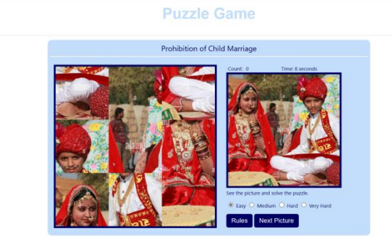
Fig -5.4: Puzzle Game