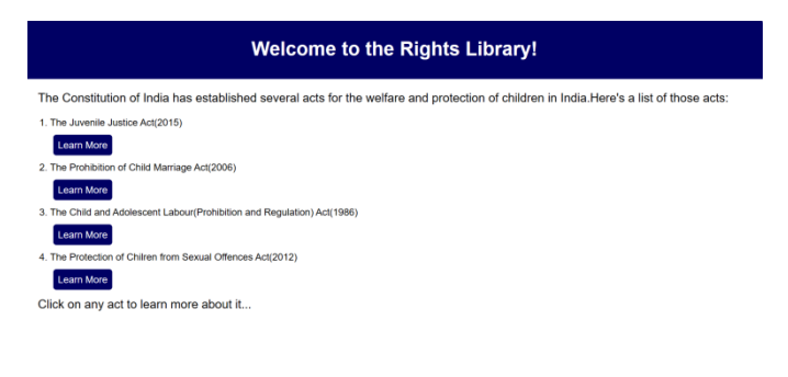
Fig -5.2: Rights Library