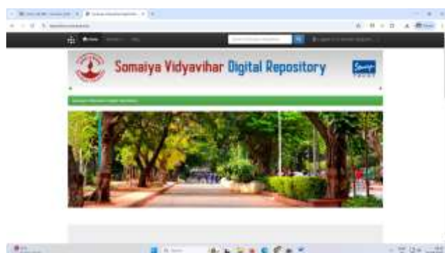
Fig.1 Somaiya repository website

All's well that ends well. The issues were in bundle however the moral of the library staff was high. This finally ended up in establishing in a good promising institutional repository. Somaiya University proudly started saying we are making open education available for all.