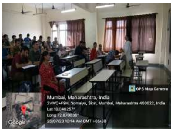
Fig 3 – Publicity of IR

Usage report graph – The usage report of the IR indicates maximum usage during the examination period. This shows popularity of IR. The richness of resources in IR will surely ensure good amount of usage. The Open Educational Resources thus enables to achieve education for all as mentioned in National Education Policy. (NEP)