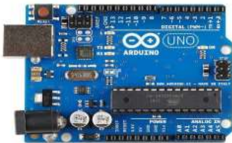
Fig.1: Arduino Uno board

Arduino Uno Microcontroller: The Arduino Uno is a microcontroller board based on the Atmega328. It has 14 digital input / output pins, 6 analog inputs, a 16 MHz crystal oscillator, a USB connection, a power jack, an ICSP header and a reset button. It contains everything needed to support the microcontroller, simply connect it to a computer with a USB cable with a AC-to-DC adapter.