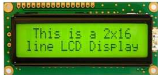
Fig: LCD Display

Liquid Crystal Display[16x2]: A Liquid crystal display is a thin, flat display unit which is comprised of any amount of colour or monochrome pixels arranged over a light source. Real time soldier location, health status and system alerts are shown in the LCD. Processed data are transmitted to the LCD by the microcontroller. It shows significant real time data at the locality in order to use easily.