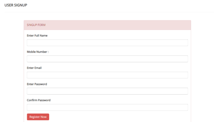
Fig -2: user signup