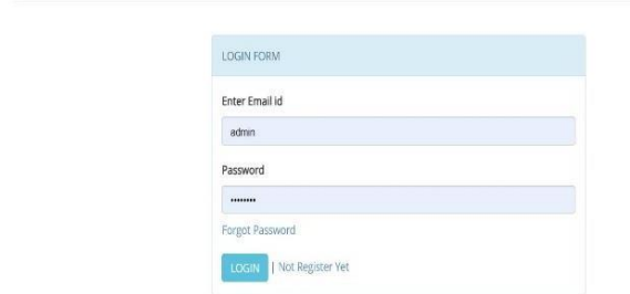
Fig-3: User Login Page