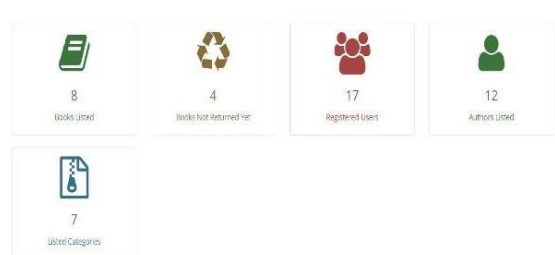
Fig-5: Admin dashboard