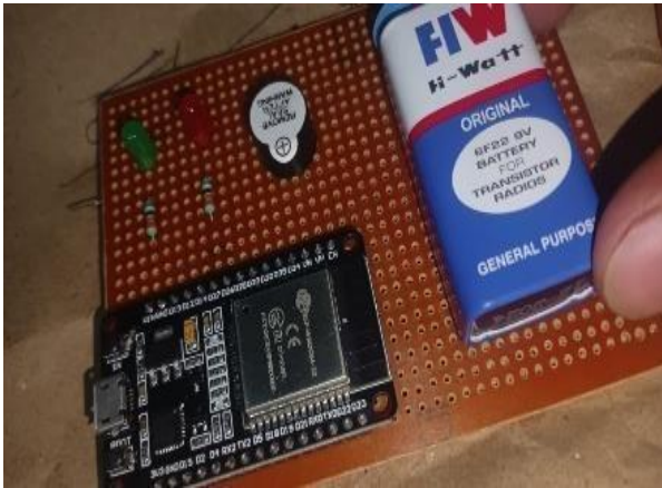
Circuit of LPG gas leakage detection system

The results demonstrate the successful implementation of the gas detection system utilizing the ESP32 microcontroller. The system effectively detects LPG leakage in real-time, with high sensitivity and accuracy. Email notifications are promptly triggered upon detection of gas presence, providing users with timely alerts for preventive action.