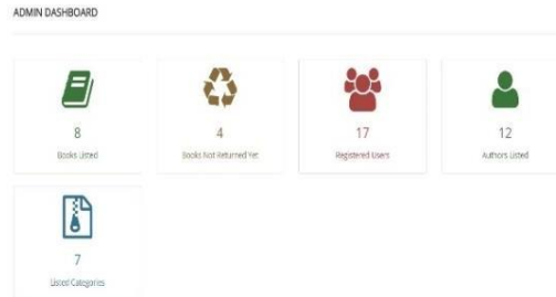
Fig-5: Admin dashboard