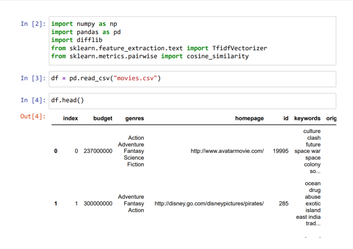
Fig: 6.1: Data collection

Secondly, we pre-process the given data.