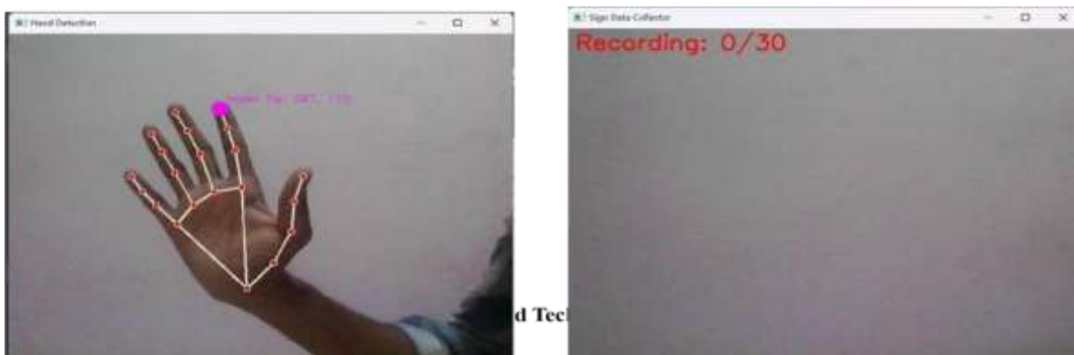
Fig no:- 02

Performance and accuracy measurements will be carried out by looking at the results of the train data and test data using epochs 30 times. The iteration produces accuracy values and loss values for train data and test data to find the values that indicate the success and loss values. In conducting trials and evaluations of the application that has been made, we use a confusion matrix to calculate the model's performance and accuracy. The data used for the confusion matrix is a dataset created by Nikhil Gupta in his research. Specific parameters or variables may affect application performance when executing the application as such: