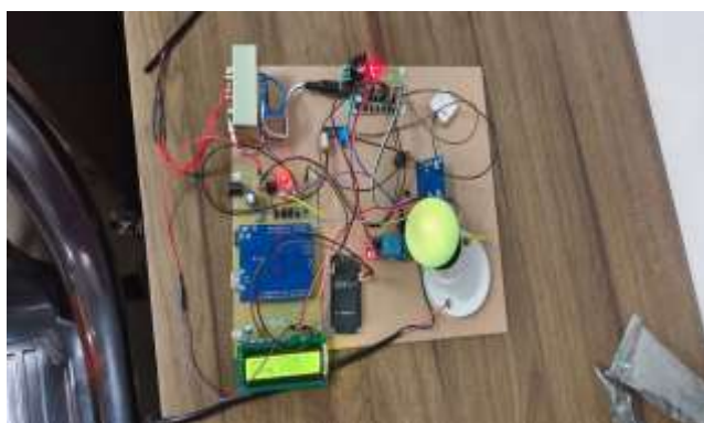
Fig 1:- Fault Detected